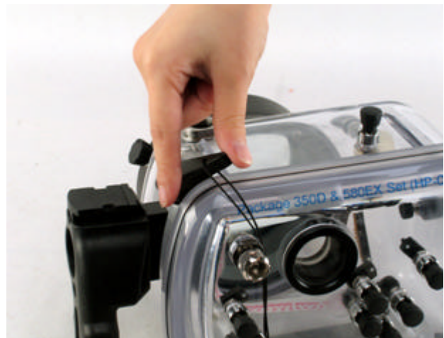
(Fig. 3) Turn to open