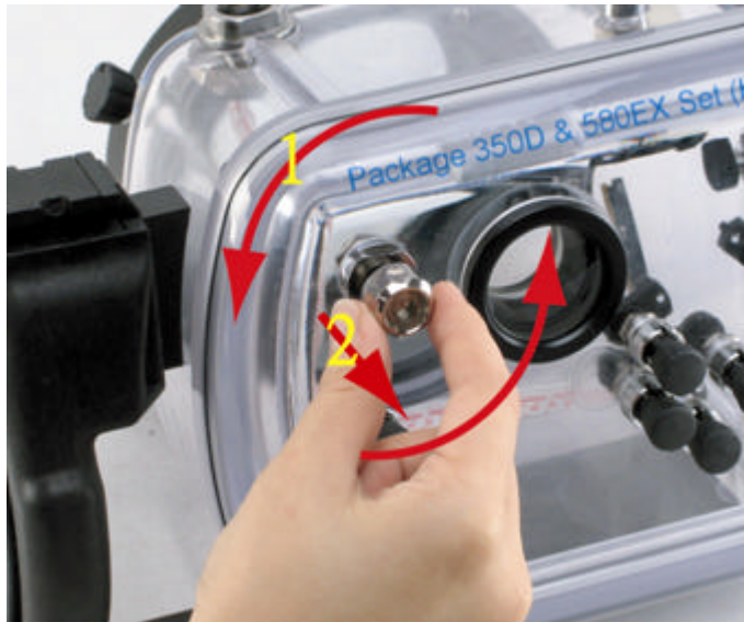
(Fig. 1) Open Housing Procedure