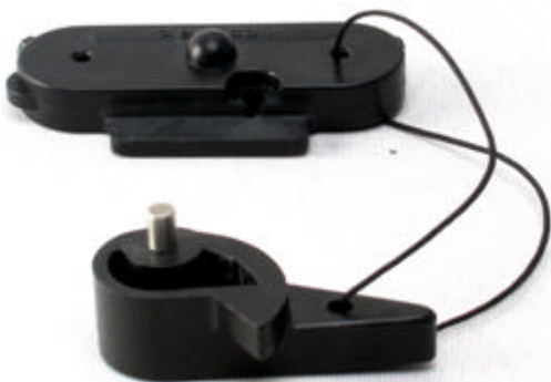
(Fig. 2) Opening lever

After unscrewing and pulling out the pressure release plug, the lid can be opened. To overcome the friction of opening, use lever (Fig. 2) to push against the lid with a cam action. Be sure they are inserted all the way flat to the housing before turning to avoid damaging the protrusions on the lid. The body has four holes on each corner edges for opening. Gently lever off the lid with the supplied opening lever (Fig. 3) taking care not to twist the lid excessively. The lid should be opened keeping it approximately paralleled to the body at all times, turn first one corner a little, then the other a little, and repeat again until the lid is opened. Remember to unscrew and pull out the pressure release plug all the way first, otherwise the air pressure will resist attempts at opening. Lay the lid on a flat stable surface after opening.