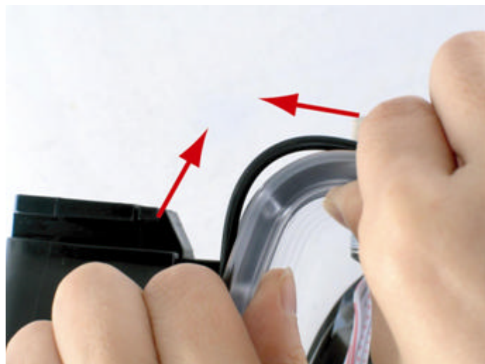
(Fig. 4) Stretch the O-ring