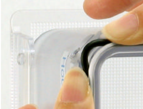
(Fig. 4) Stretch the O-ring