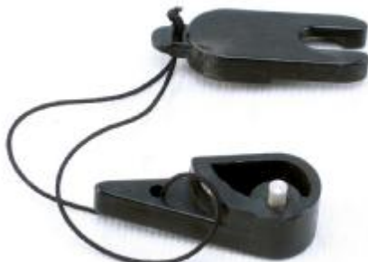
(Fig. 2) D80 Opening Key / Lever

After unscrewing and pulling out the pressure release plug, the lid can be opened. To overcome the friction of opening, use lever (Fig. 2) to push against the lid with a cam action. Be sure they are inserted all the way flat to the housing before turning to avoid damaging the protrusions on the lid. The body has four holes on each corner edges for opening. Gently lever off the lid with the supplied opening lever (Fig. 3) taking care not to twist the lid excessively. The lid should be opened keeping it approximately paralleled to the body at all times, turn first one corner a little, then the other a little, and repeat again until the lid is opened. Remember to