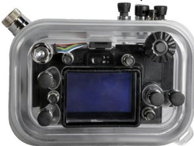
Slide the hot shoe plug into the hot shoe

Check the bulkhead cable is not jammed under any button or over the o-ring